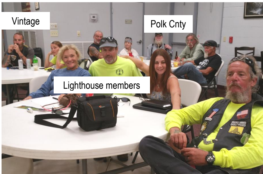
Want to thank: Vintage – Polk County & Lighthouse ABATE members for visiting us at our general mtg Sun Aug 6th