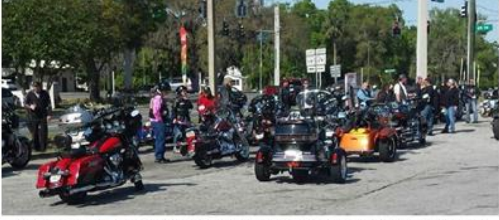
March 24, 18 - It was food, good weather & good camaraderie - & lots of participation a Big thank you to Tramp for chairing this annual run to 'Shrimp R Us'